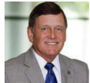
Lt. Gen. Tom Baptiste National Center for Simulation